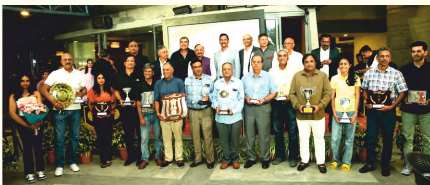
Winner & Runner of Justice Subrahmanya Iyer Cup and Independence Shield