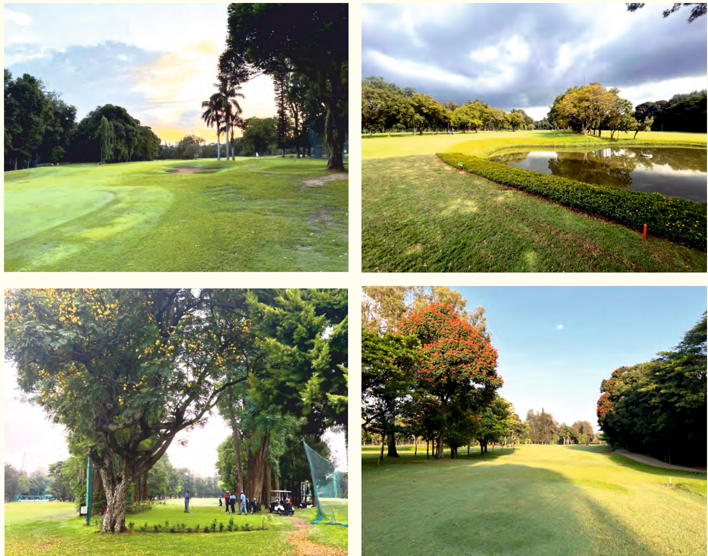
"Post Cards from our Club"