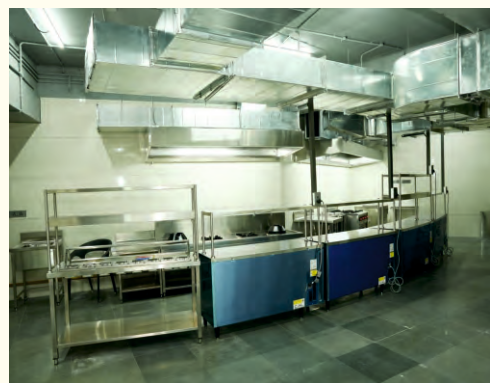
Newly Completed Kitchen