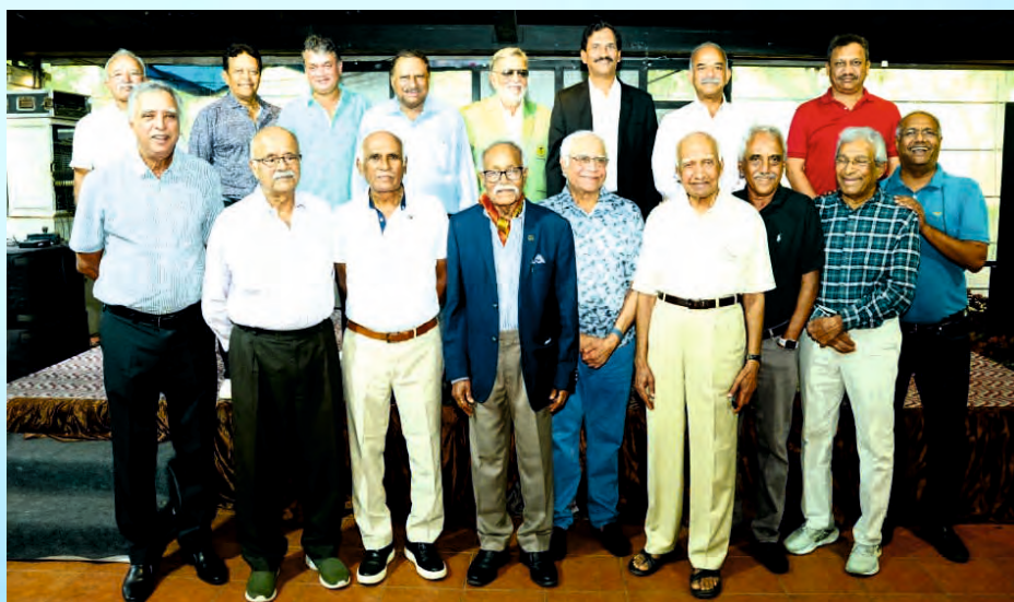
Gordon Pearce Cup Tournament