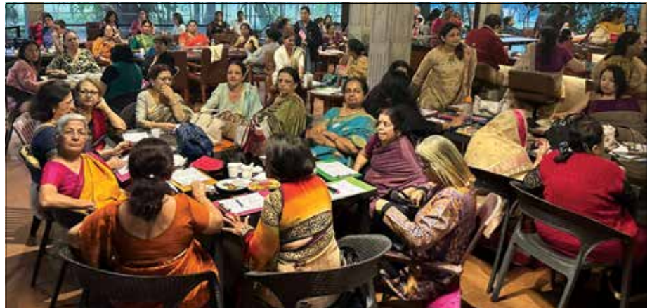
Sankranti super bumper Tambola