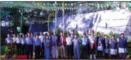
75th Republic Day Celebrations