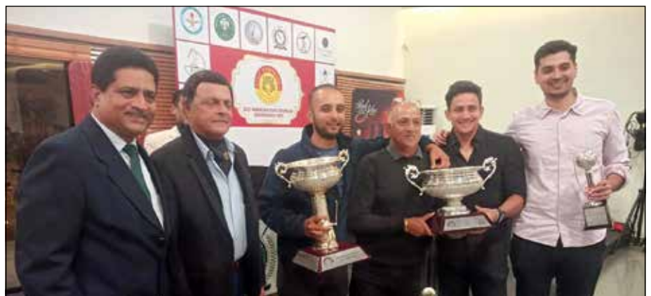
Golf Karnataka State Inter-club Championship 2025