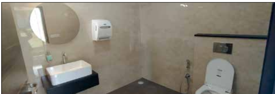
Restroom facility in the 3/8 tee box